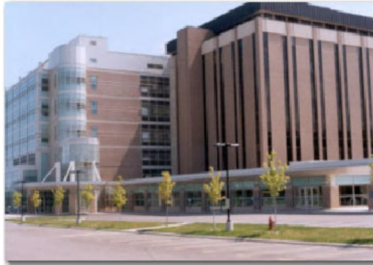
Waisman Center in Madison, Wisconsin

This research is approved by the University of Wisconsin-Madison Institutional Review Board for the Protection of Human Participants (Social and Behavioral Sciences; 608-263-2320). All information collected as part of this project will be kept confidential in accordance with university and federal regulations.